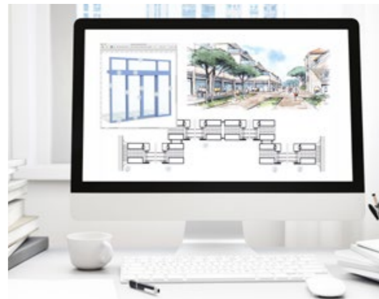
Visit stalprofil.se to download drawing tips, outline drawings and profile cross section – free to use!